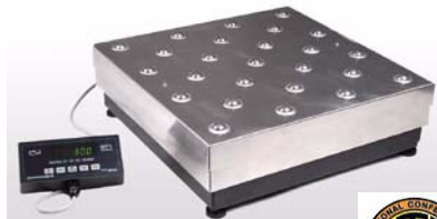
Shown with Optional Roller Ball top

The SRP-300 multi-purpose NTEP approved bench scale is designed for use in today's rugged industrial applications. It is constructed utilizing a heavy-duty carbon steel understructure allowing for maximum overload protection, a sealed aluminum lead cell, and a heavy gauge stainless steel weigh pan. Includes six feet of cable from the base to the indicator. The scale can transmit on demand or continuously in several popular UPS manifest data protocols. You can use either full duplex RS-232 serial port, WLAN, or Bluetooth format to interface with computers or remote displays. Display is a 7-digit blue/green VFD. Platform Size: 18" x 18" stainless steel. Power: AC Adapter, 12 Vdc, 800mA. COC# 96-136A1. Shipping weight 60 lbs. Warranty 12 months.