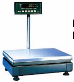
PC-30/70 WITH TOWER MOUNT